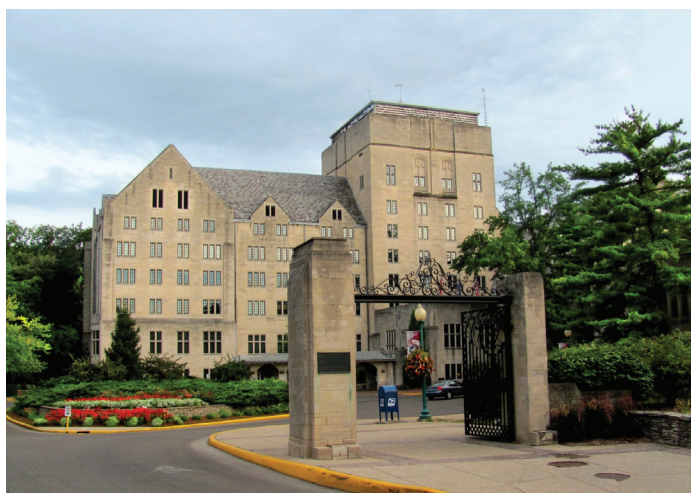
The Indiana Memorial Union is a 500,000 square foot limestone masterpiece. Its transformation to Big Fucking Hole begins later this week.

These changes mean students would no longer have to deal with so many of the current IMU's issues, such as the lack of down-escalators, a cafeteria that only takes Campus Access